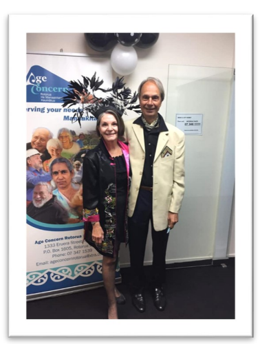
People really got into the spirit of 'A Night at the Races' Trivia Quiz.

The 25 teams all got into the spirit of the theme (A Night at the Races) and came dressed to the nines. Congratulations to the team from Specsavers (Spectacular) who came out on top with a winning performance and all the other teams for their support by coming to the event and getting into the spirit of things. As a fundraiser, it was very successful and we raised just under $6,000.